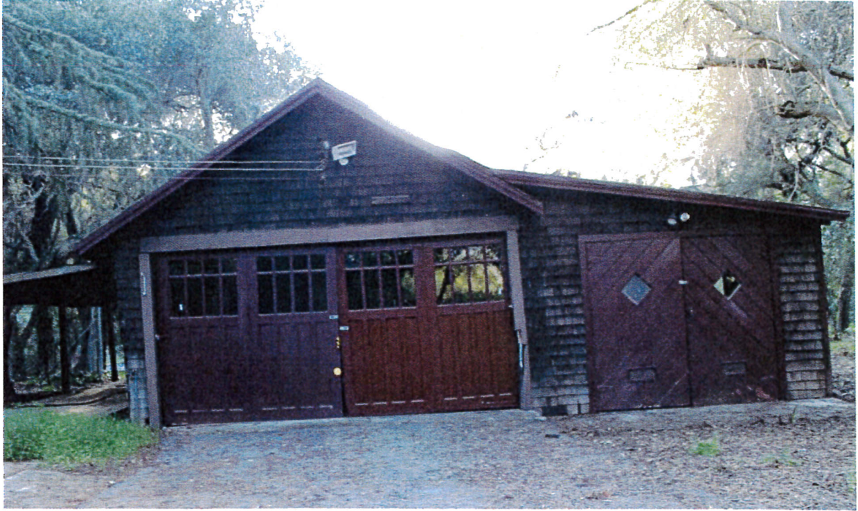
Photograph 8 13561 Burke Road View: The barn/garage front façade. Addition on the right and the shed cover on the left