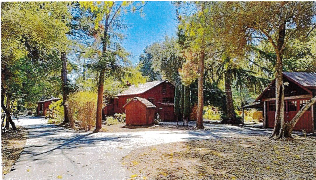
Photograph 7 13561 Burke Road View: from the north the garage is on the right, the play house is next to the north end of the main house.