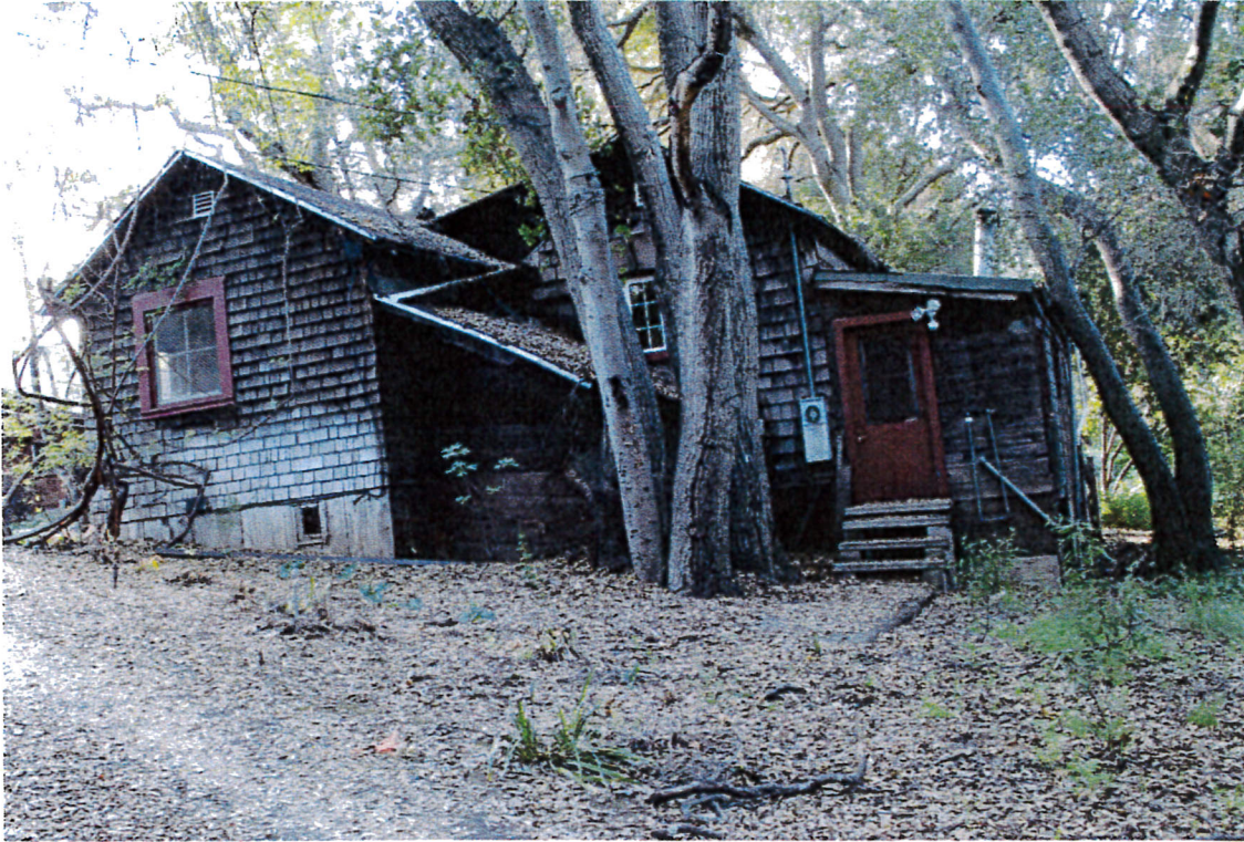
Photograph 10 13561 Burke Road

View: from the driveway looking at the caretaker's cabin with several additions.