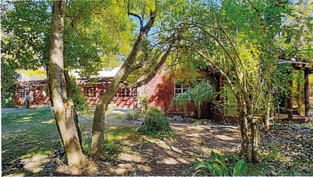
Photograph 4 13561 Burke Road

View: Rear and south façade showing the banks of windows along the rear wall and the south end with the addition on the far right.