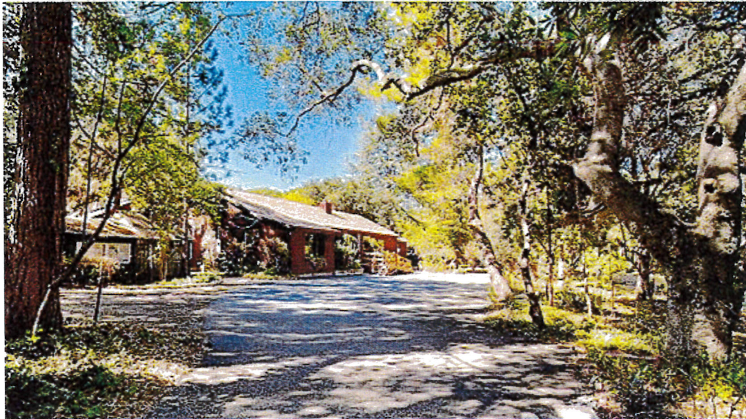
Photograph 2 13561 Burke Road View: Front façade (east) showing the center entrance and porch, ramp is not original. On the left is the garden house.