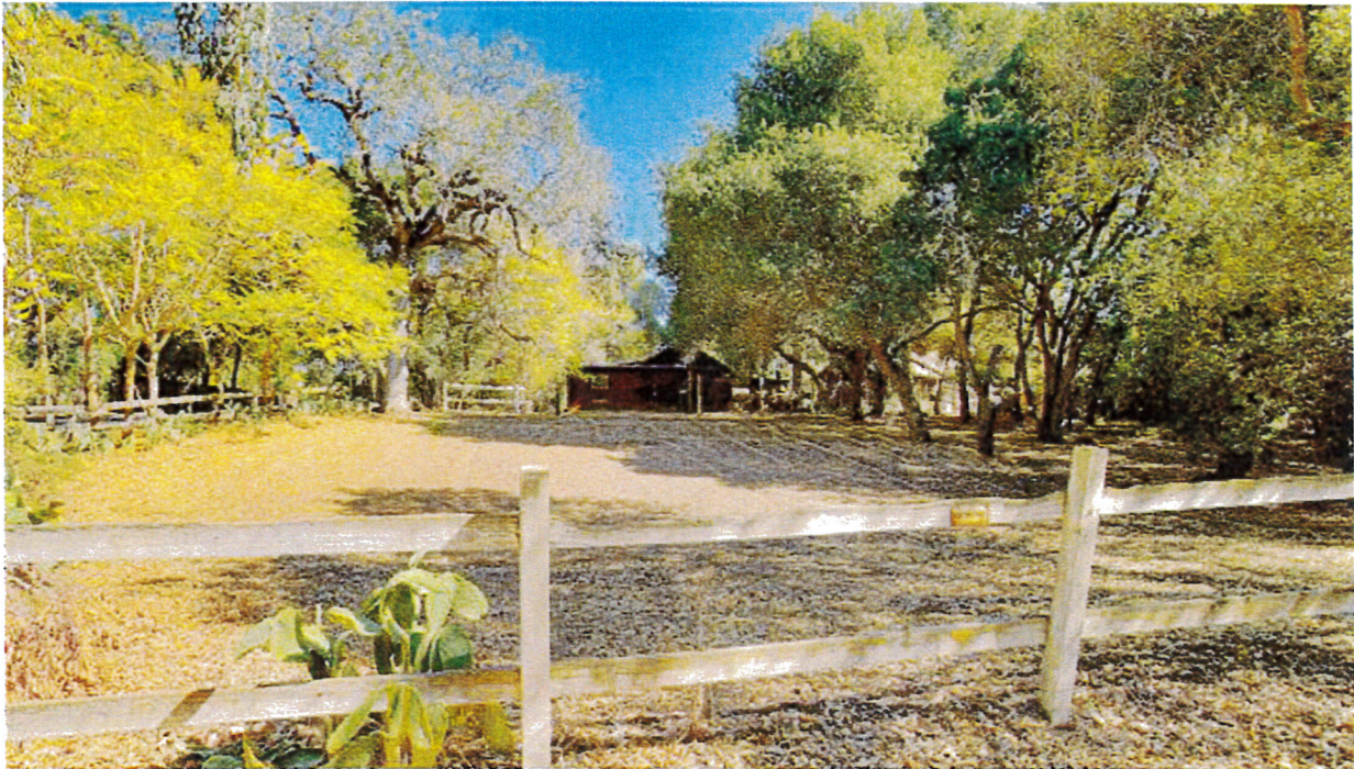
Photograph 12 13561 Burke Road View: Across the paddock to the stables