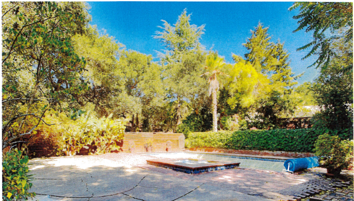
Photograph 9 13561 Burke Road View: Behind the house is the swimming pool terrace.