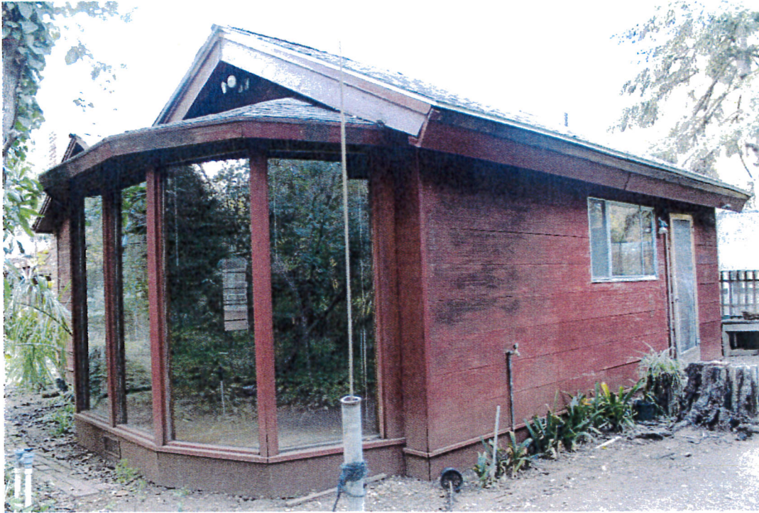
Photograph 6 13561 Burke Road View: Rear façade addition to south side of the main house c.1970s.