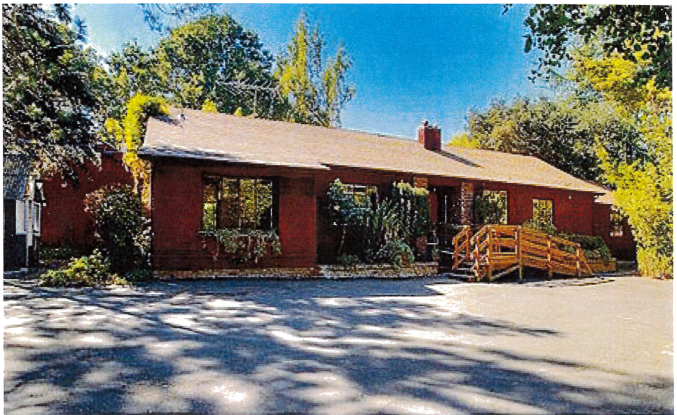
Photograph 1 13561 Burke Road

The complex presents the impression of a Mid-century country home with ancillary features for swimming, horses and gardening. The number of trees and bushes indicates the work of George D. Cummings and his enjoyment of plants. Many appear to have been distressed over the past few years. It does not display significant architecture in any of the buildings and collectively the only architectural theme is found on the main house- horizontal board siding and used brick. Otherwise there is not a cohesive theme to the enclave.