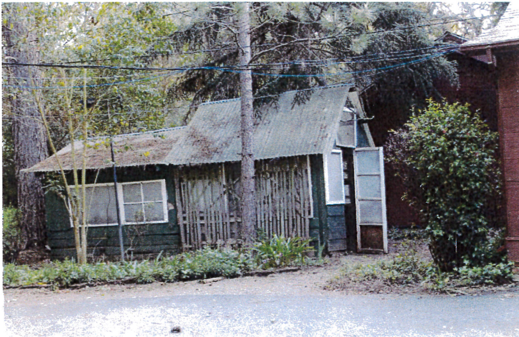
Photograph 3 13561 Burke Road View: Garden House/Greenhouse, Side façade facing the driveway.