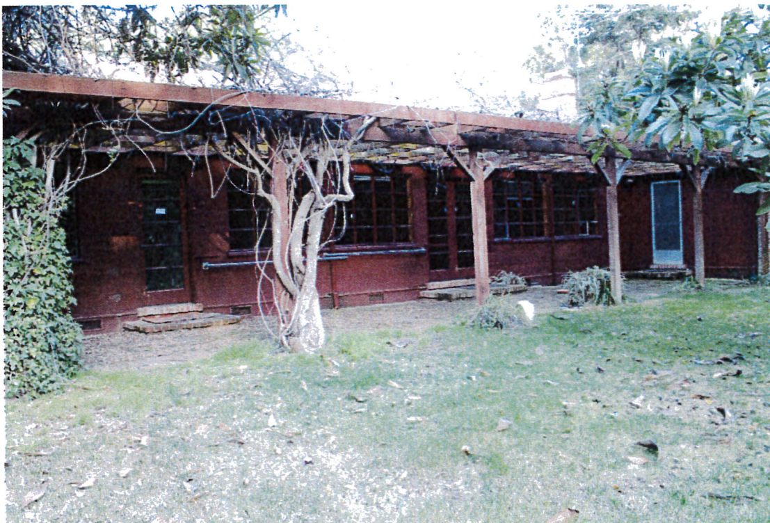
Photograph 5 13561 Burke Road

View: Rear and south façade showing the banks of windows along the rear wall and the south end with the addition on the far right.