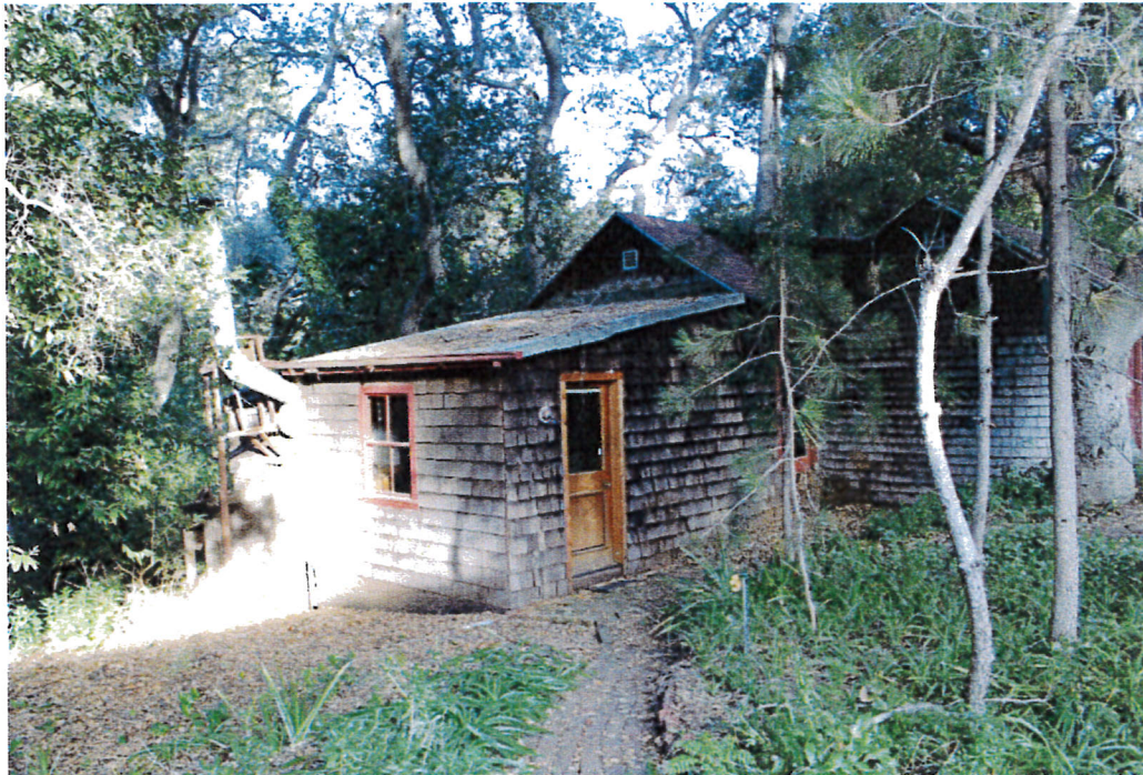
Photograph 11 13561 Burke Road

View: from the driveway looking at the caretaker's cabin with several additions.